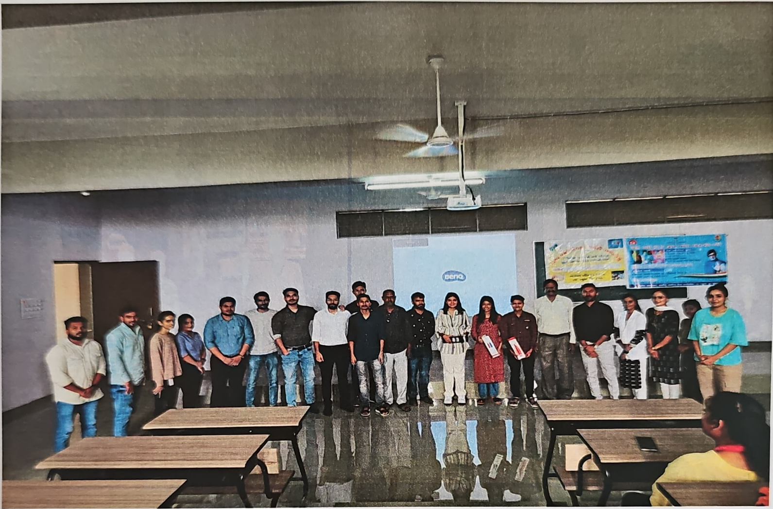
Glimpse of the event